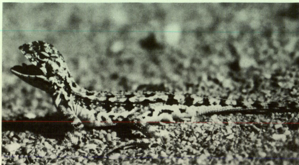
Fig. 1. Holotype of Amphibolurus parviceps butleri , photographed in life by G. Harold.

Edel Land, mid-west coast of Western Australia.